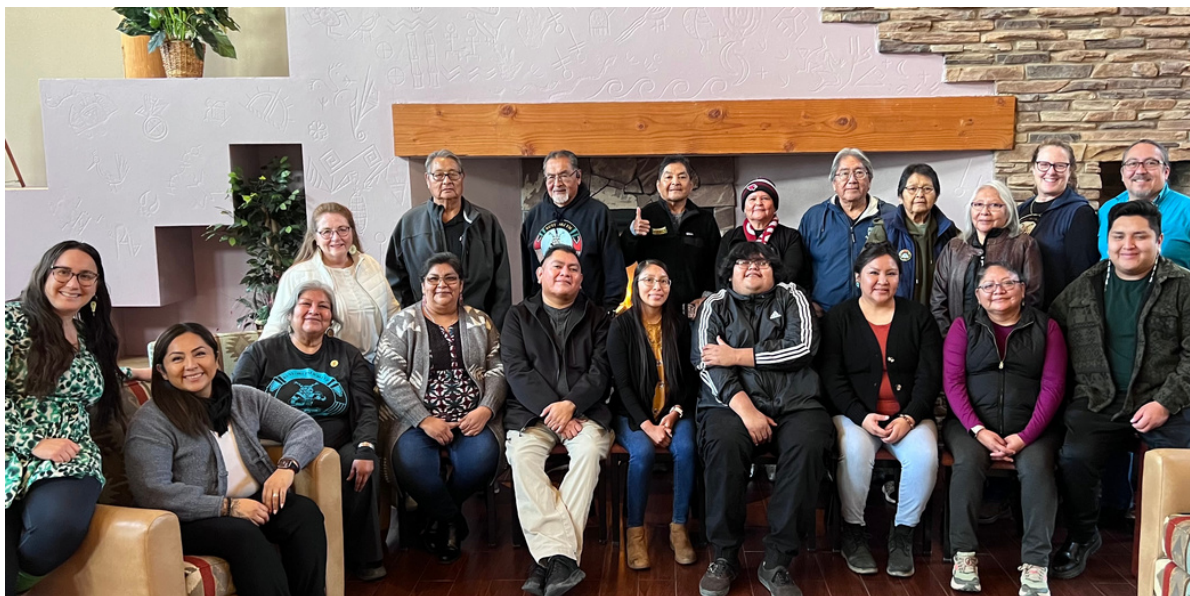
Attendees of the 2024 KUYI Strategic Planning Session @ MLI